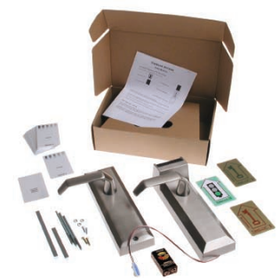
Access-kit ready for installation.

With the features Stand-Open and Temporary blocking of all users , TL Access is specially useful for rooms like changing-rooms, club facilities, meeting rooms, store rooms, conference rooms and lecture halls.