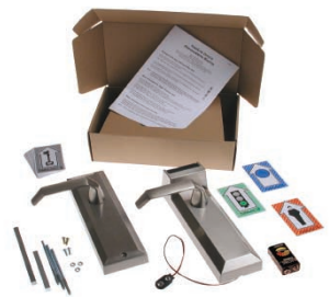
Office-Kit ready for installation.

With TL Office you can easily select the accesses you want to make invalid. These could be cards lost by staff or retained by ex-employees for instance.